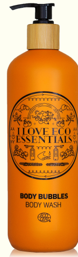
Body wash 600ml. 'BODY BUBBLES' Also available with cap*