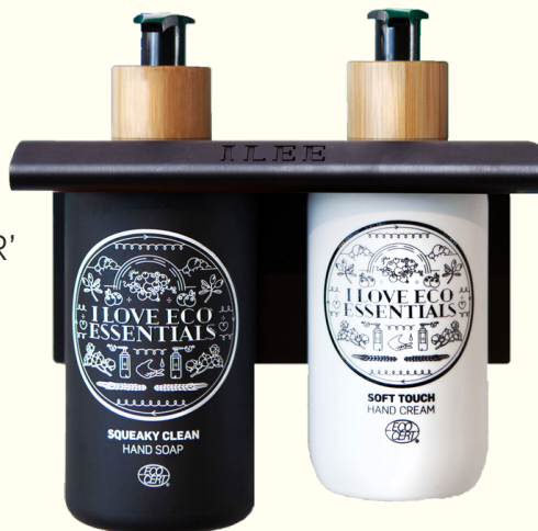
'WALL HANGER' Double holder