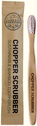
Bamboo toothbrush 'CHOPPER SCRUBBER'