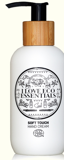
Hand cream 200ml. 'SOFT TOUCH' Also available with cap*