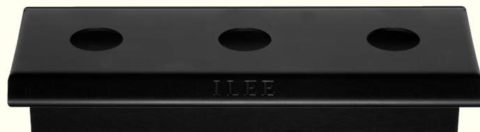
'WALL HANGER' Triple holder