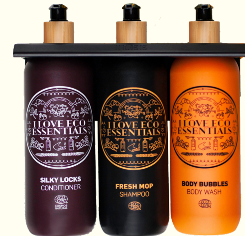
'WALL HANGER' Triple holder

* Re-use the pump several times to cut in cost and waste