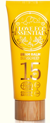
Sunscreen 100ml. 'BEAM BALM'