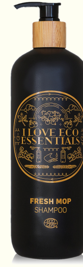
Shampoo 600ml. 'FRESH MOP' Also available with cap*