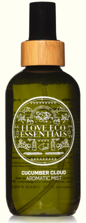
Room spray 200ml. 'CUCUMBER CLOUD'