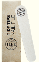
Nail file 'TIDY TIPS'