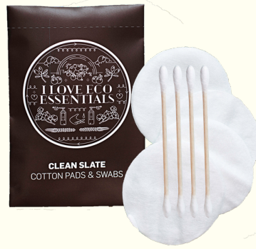
Cotton pads & buds 'CLEAN SLATE'