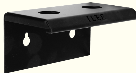
'WALL HANGER' Double holder