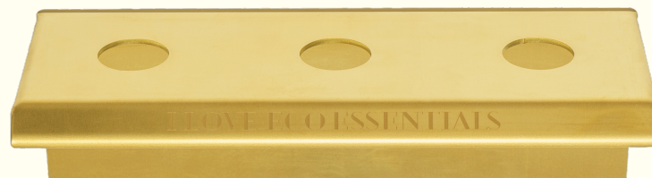
'WALL HANGER' Triple holder