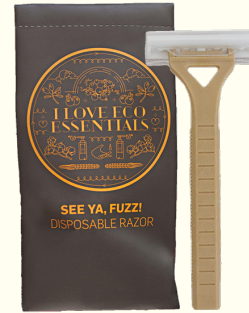
Disposable razor 'SEE YA FUZZ!'