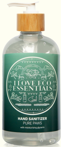
Hand sanitizer 500ml. 'PURE PAWS'