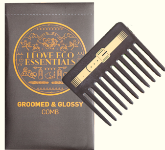
Waste-plastic comb 'GROOMED & GLOSSY'