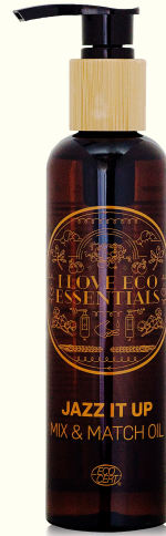
Mix & Match oil 150ml. 'JAZZ IT UP'