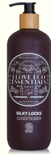
Conditioner 600ml. 'SILKY LOCKS' Also available with cap*