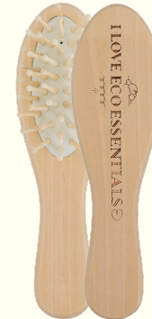
Wooden hair brush 'Brush on!'