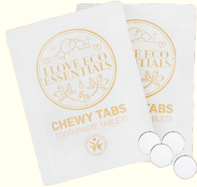
Toothpaste tablets 'CHEWY TABS'