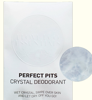
Crystal deodorant PERFECT PITS