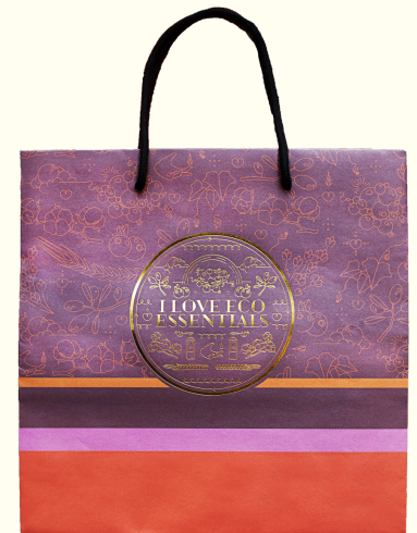
Recycled lux bags 'GOLD WITH HANDLE'

* Re-use the pump several times to cut in cost and waste