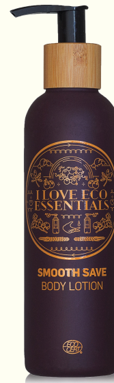
Body lotion 250ml. 'SMOOTH SAVE' Also available with cap*