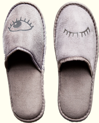
Slippers 'COSY TOES'