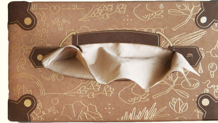
Bamboo tissue Box 'WICKER WIPES'