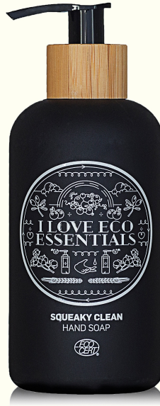
Hand soap 250ml. 'SQUEAKY CLEAN' Also available with cap*